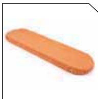
460 Mattress Bolstered #0313063 (burgundy) #0312720 (orange)