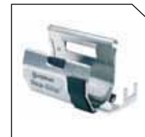
514 Oxy-Clip #0085500