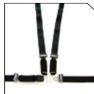
417-1 Restraints #0313915 (black) #0313914 (orange) #0313896 (burgundy)