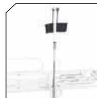
513 IV Pole #0085130