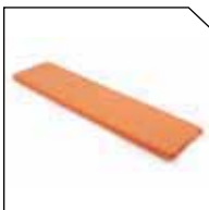
360 Mattress Flat #0313692 (burgundy) #0313691 (orange)