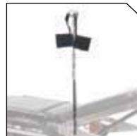
513-11, HD/NM #0087157