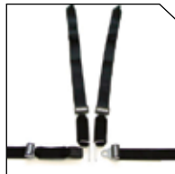
417-1 Restraints #0313915 (black) #0313914 (orange) #0313896 (burgundy)