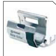
514-1 Oxy Clip #0085520