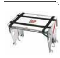
274-S PacRac™ #0818952