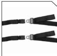
430 Restraints #0313892 (2pc. 5' blk) #0313891 (2pc. 5' org) #0313890 (2 pc. 5' burg)