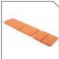
Mattress 359-8 #0311220 (orange) #0313099 (burgundy)